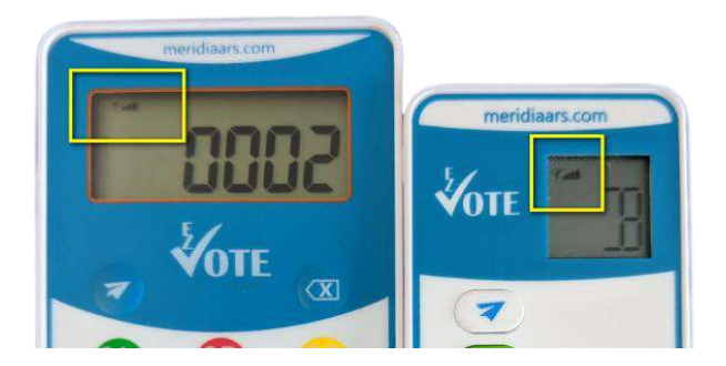
Figure 3 - Signal strength depends on the distance of the keypad from the base

When the keypad and base connect, you'll see a 'signal strength' icon in the top-left corner of the keypad display: