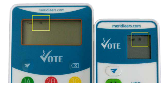
Figure 4 - "R" indicates that polling has been opened and participant can vote

When polling/testing mode is turned ON, the keypad display indicates an active polling session by a small "R" showing/flashing at the top of the display: