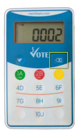
Figure 1 - PLEASE NOTE: Keypad ID will only show if the keypad is NOT in polling/testing mode

EZ-VOTE 10 keypad allows the user to determine the Keypad ID by simply pressing the "Clear" (backspace) button. EZ-VOTE 5 does not have this option: