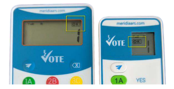
Figure 5 - "OK" indicates that your vote has been received by the base receiver

Once the participant has voted (valid vote has been submitted), the keypad will confirm that the vote has been counted by showing "OK" in the top-right corner of the keypad display (EZ-VOTE 10), or below the signal strength icon (EZ-VOTE 5):